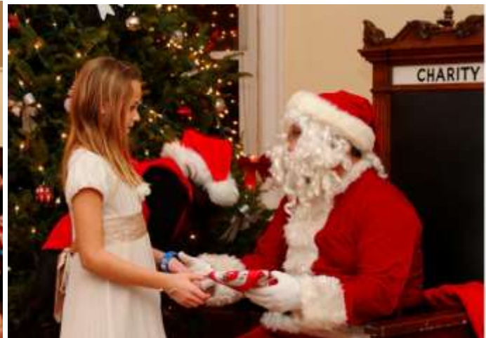
Presents for All!!!