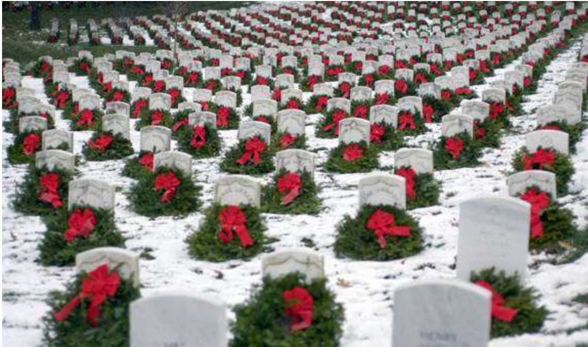
Christmas at Arlington Cemetery