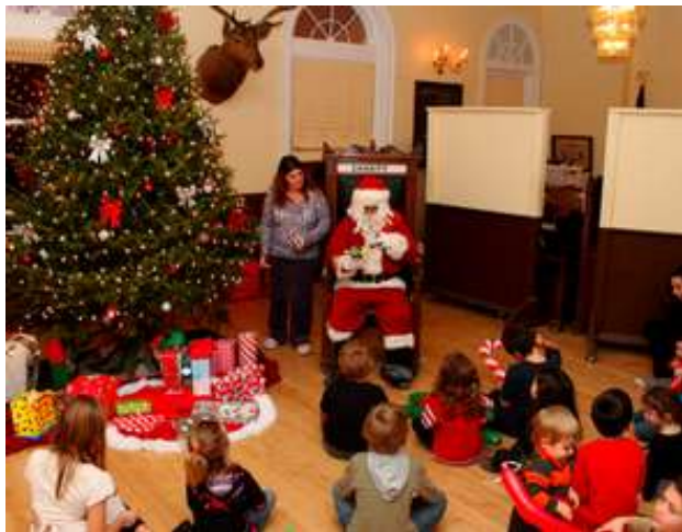
SUMMIT LODGE CHRISTMAS PARTY 2011