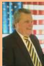
~Message From District Deputy Grand Exalted Ruler ~

Fall is here and so are the Pre-visits and Ritual. Our first visit was at Elizabeth-Linden and because they were prepared, everything went smoothly and we were able to gather all the information we needed and were out of there in no time.